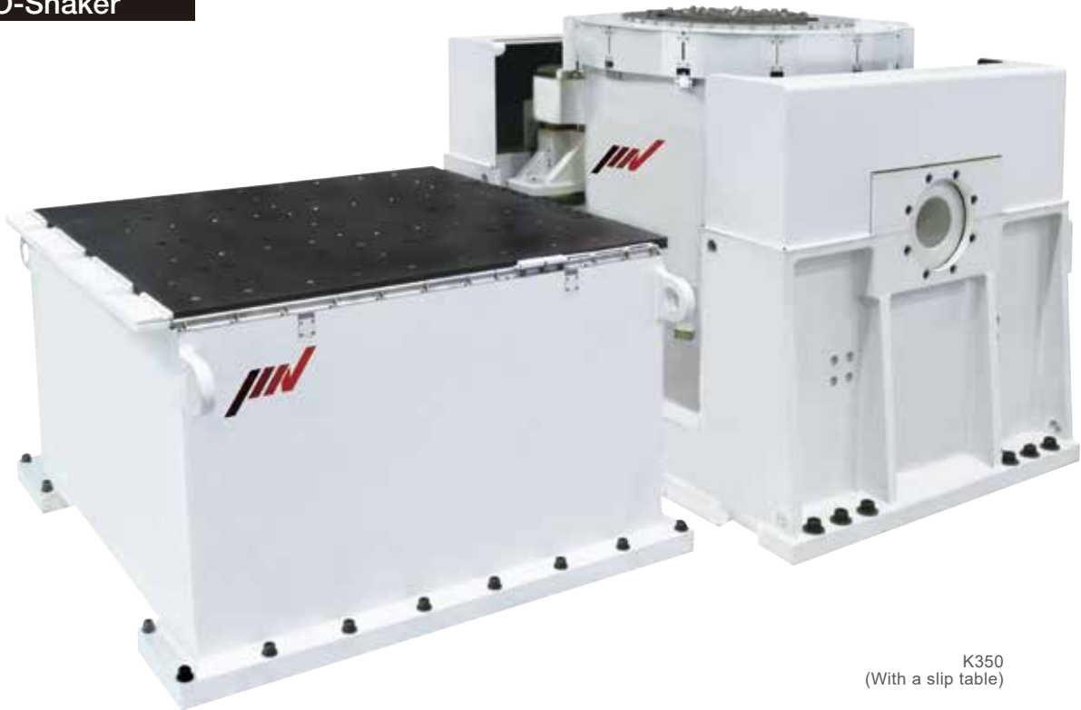
K350 (With a slip table)